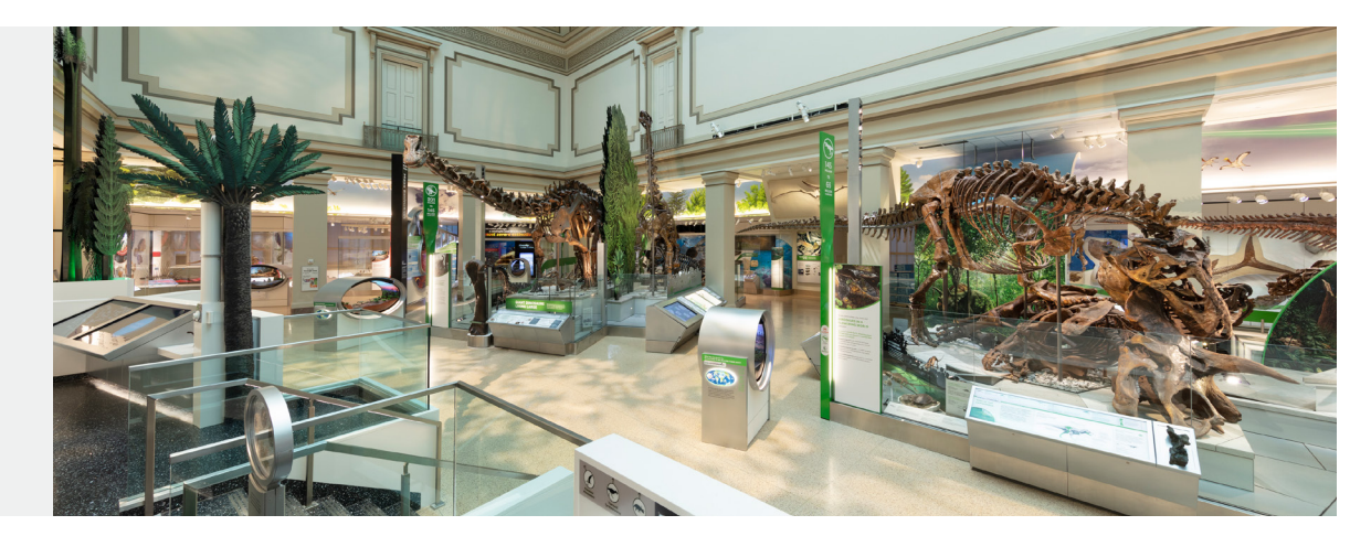
The 31,000-square-foot Deep Time exhibition at the National Museum of Natural History, structured as a journey through time, educates visitors on how humans are shaping the future and the fate of life on Earth.