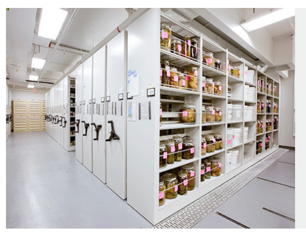
Collection space interiors: Inside the Dulles Collection Center — Module 1 (left). Collection storage space inside the Museum Support Center (right).