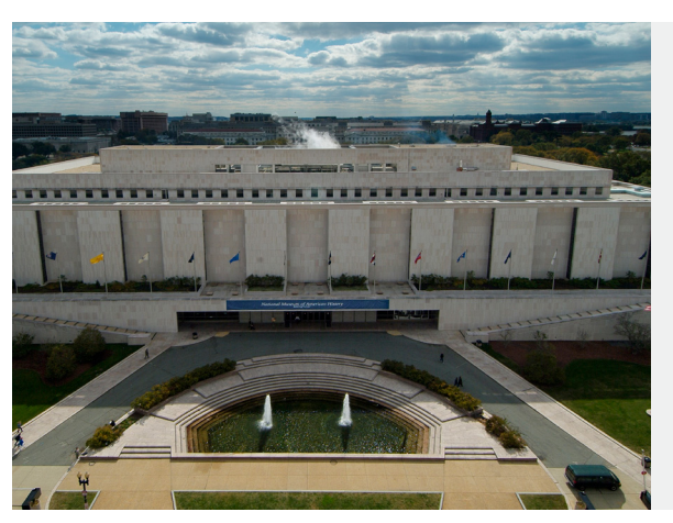
The Smithsonian is taking action to improve protection against flooding. This includes project plans for The Museum of the American Indian in New York City (left) and the National Museum of American History (right).