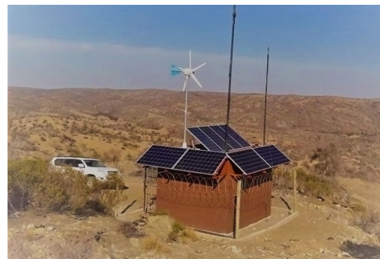
EMBASSY WINDHOEK'S SOLAR- AND WIND-POWERED RADIO REPEATER TOWER

U.S. Embassy Windhoek had frequent issues with emergency radio broadcasts because of power fluctuations to radio repeaters. To solve the problem and ensure the radio would be available in a life-or-death situation, the Embassy turned towards green solutions. They installed a wind turbine and solar panels on the radio repeaters, ensuring constant power to the site. They also incorporated a Global System for Mobile (GSM) communications control solution for repeater tower operations, meaning personnel could perform basic maintenance tasks remotely. Not only was the green solution the cheapest solution with no associated monthly costs, but removing the need for weekly maintenance trips saves Embassy Windhoek and the Department time and money while reducing their overall carbon footprints.